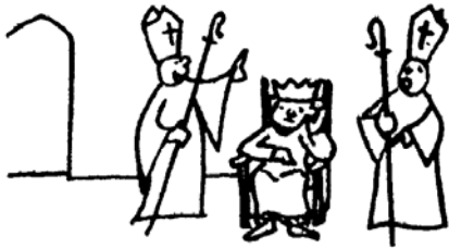
HELPED KINGS TO GOVERN THEIR COUNTRIES