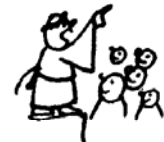
PREACHED IN THE STREETS