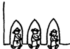
MONASTERIES CONVENTS PRIORIES