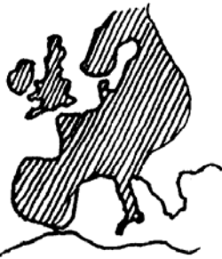
WESTERN EUROPE CATHOLIC