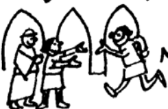
MEETING PLACE FOR PEOPLE