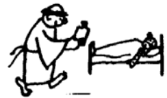
HELPED SICK IN THEIR OWN HOMES