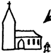
PARISH CHURCH AND PARISH PRIESTS