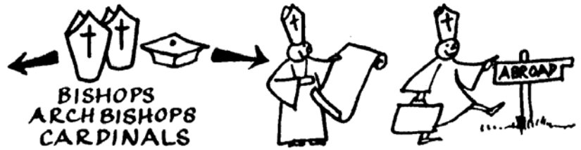
BISHOPS ARCHBISHOPS CARDINALS