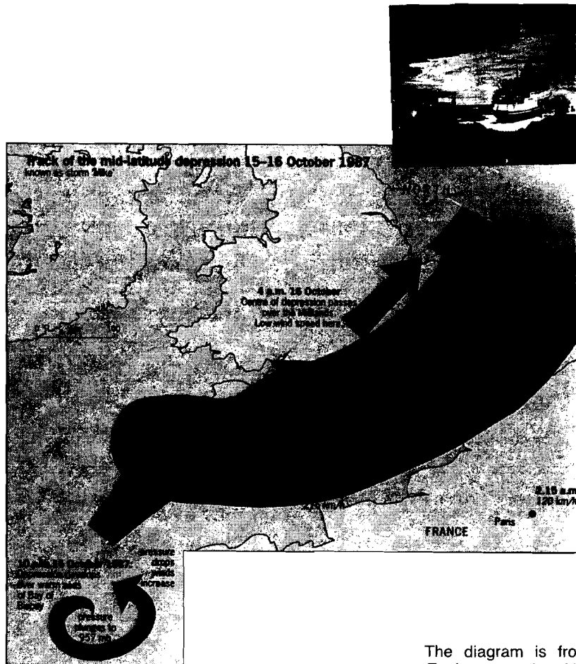
The diagram is from Insight Geography: The Environment by V Bishop and R Prosser published by Harper Collins.